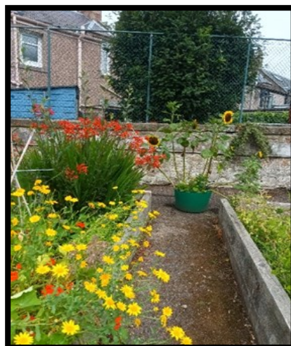
Sunflowers, Nasturtiums, Montbretia