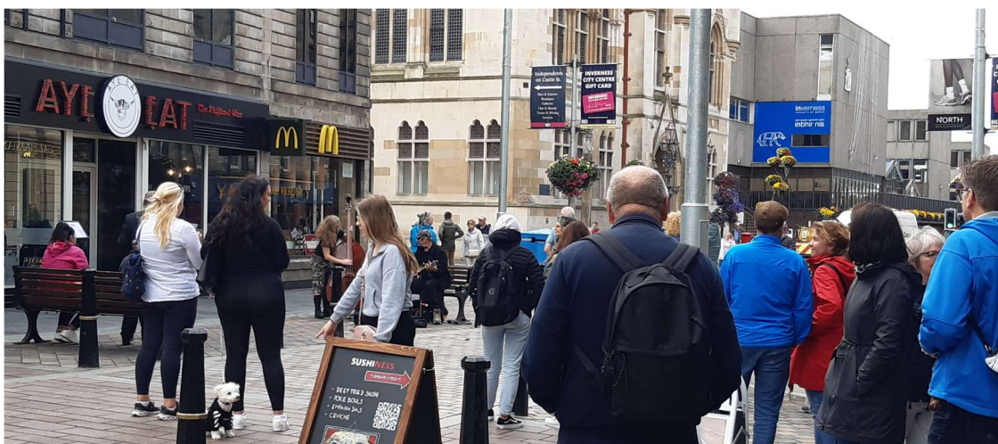
Inverness High Street. Everyone busy, but not too wrapped up in themselves not to say “Hello”

Jesus noticed people. He reached out to people on the margins, people who perhaps others would not speak to, people whose lives were in a mess. As Street Pastors we take the church, Jesus’s church, to where there is need on the streets. However, you don’t need to be a Street Pastor, or to have special skills, to just say “Hello” and you may never know what a difference you have made to someone who is struggling.