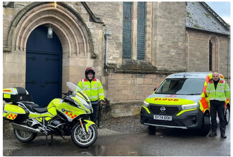
Blood Bikes Representatives arrive at St Stephen's for the Cheque Presentation