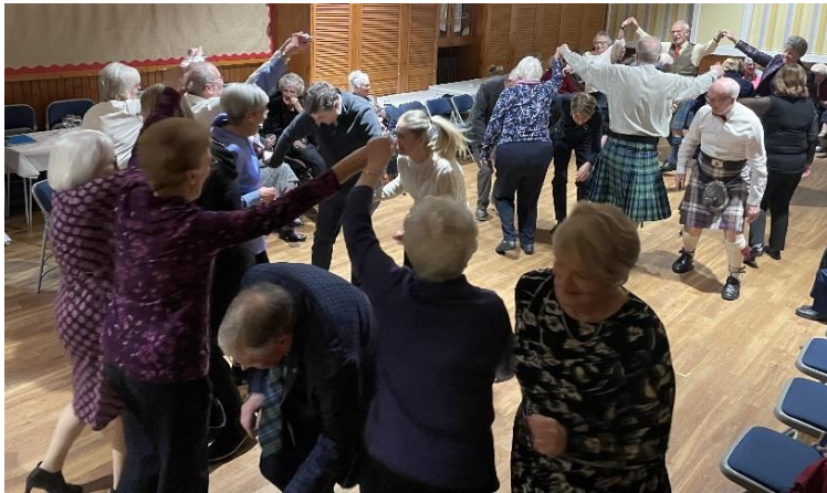
The Dashing White Sargeant