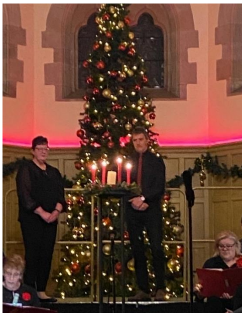
Church and Community Choir - The Candles are Lit