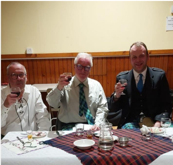
The Top Table