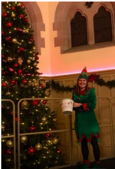
Church and Community Choir - A Charity Elf!!