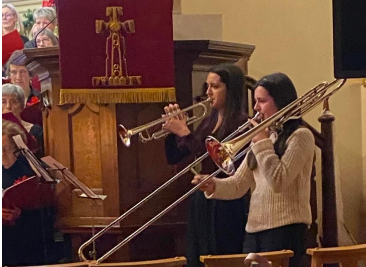
Church and Community Choir - two musical sisters