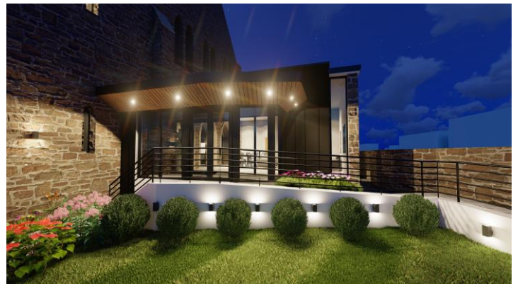
Night-time image and welcoming lighting.