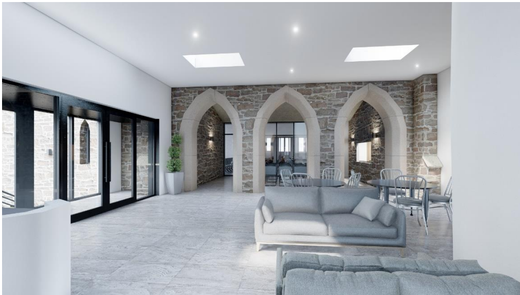
Architect's image of the new foyer leading directly into the Sanctuary.

The visible, inviting space will encourage community involvement and make the church more approachable. The Crown area does not have a community centre, and we are increasingly welcoming more community groups to use our spaces. The new, easily accessible flexible spaces we will be able to offer will, we hope, increase this use, thus adding to our financial sustainability, and that in turn will secure our future as both a centre for worship and a community resource.