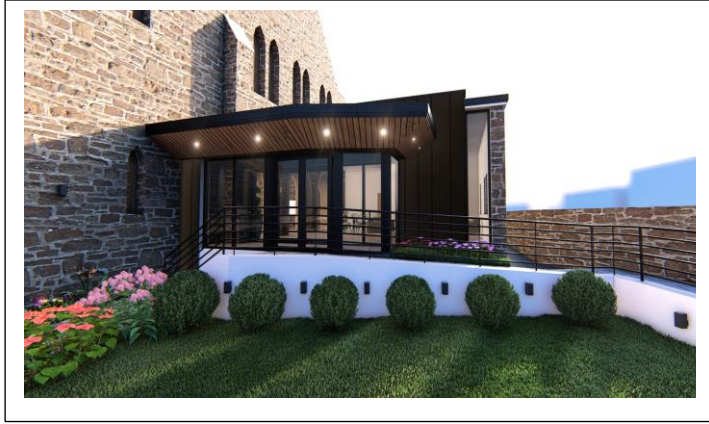
Architect's image of new ramp, automatic doors and long windows

The visible, inviting space will encourage community involvement and make the church more approachable. The Crown area does not have a community centre, and we are increasingly welcoming more community groups to use our spaces. The new, easily accessible flexible spaces we will be able to offer will, we hope, increase this use, thus adding to our financial sustainability, and that in turn will secure our future as both a centre for worship and a community resource.