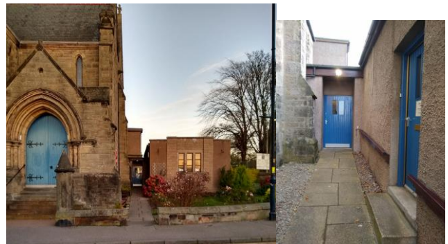
The current extension and narrow accessible entrance

We anticipate that this will significantly enhance the public's perception of the church, as floor-to-ceiling windows will provide clear visibility from the street. Currently the Victorian aspect of the building belies the activities and ethos of the congregation, and the existing wheelchair/pram access is more of an obstacle course, particularly on a windy day when a fierce draught pulls the door out of even an able-bodied person's hands. From a stranger's point of view, the provision of a clear main entrance does away with confusion over which of our five doors to use.