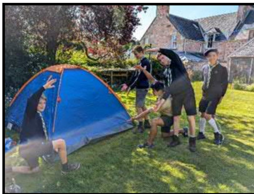
The scouts putting up the tent.