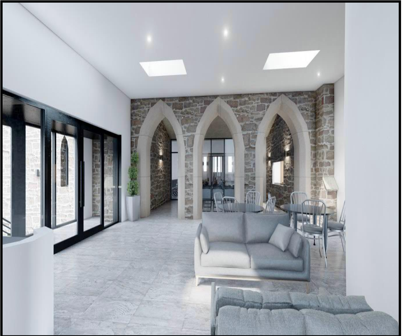
The projected new entrance foyer

The full extent of these plans and helpful images can be found on the website. We will now begin to address the details, and start to look for grant funding for much of the approximately £600,000 which the plans will cost.