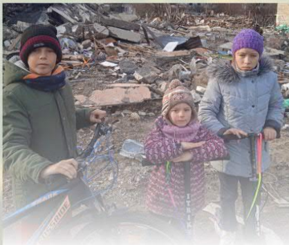
"Feed my sheep."

This April saw the launch of our exciting new Do You Love Me? appeal. Jesus asked this simple but important question to Simon Peter three times and each time Jesus issued Simon Peter with a challenge; "Feed My sheep" , "Tend My sheep" , and "Feed My lambs" . Focusing on these challenges the Do You Love Me? campaign gives you the opportunity to show your love by committing to a monthly giving to a specific outreach. With our Disaster Relief we look to feed His sheep by giving much needed food and shelter to those effected by disaster, like the devastating war in Ukraine that has taken so much from the Ukrainian people. Or help the shepherds tend to the sheep with our Pastor Support, as we aid those in the ministry as they spread the Gospel and do God's work in their communities. Through education we look to feed His lambs, as we support gospel centred educational outreaches and programmes that make lasting impacts to vulnerable communities- such as Cornerstone in Mumbai, India. Providing additional educational and humanitarian support, Cornerstone works with women sold into sex work and their children as they look to find opportunities in life that otherwise would not be achievable. To sign up or to find more information about each of these outreaches, visit doyouloveme.world . This faithful and committed giving is important in allowing us to continue our gospel centred outreach into desperate communities.