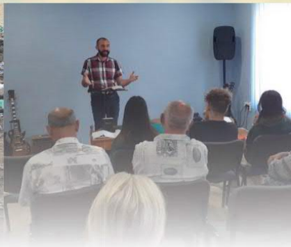
"Tend my sheep."