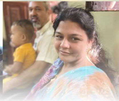
"Feed my lambs."