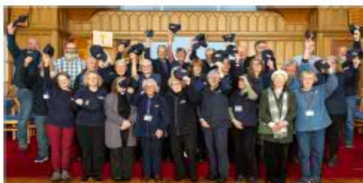
Inverness Street Pastors altogether - Prayer & Street, old & new.

It's a busy time for mental health services. Pray for Mikey's Line, The Samaritans and all front-line mental health professionals. Pray that, we too, can respectfully minister to those for whom the lead up to Christmas is a heavy burden.