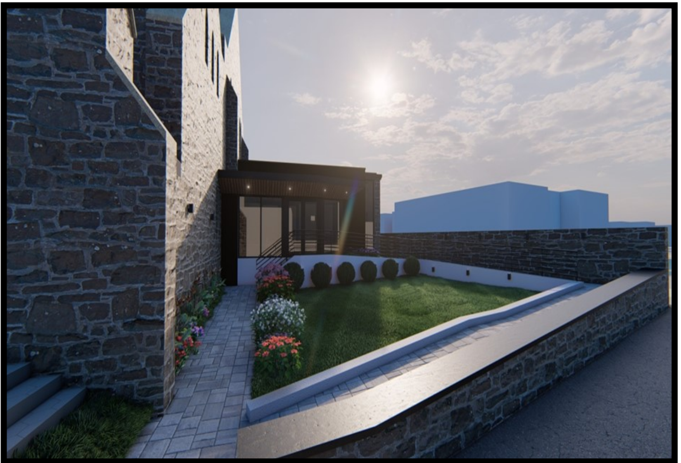
Visualization of the new main entrance to our buildings.

The main emphasis in these discussions has been on ensuring that when we meet for worship all will have been done to maintain those aspects of our heritage which enhance our worship while allowing flexibility both in layout for worship, and layout for weekday activities. At the same time, we have spent considerable time in refining the concept of a main entrance and what is needed for access for able and disabled, during the day and on a dark winter evening that would be welcoming and encouraging for newcomers and regulars to our buildings.