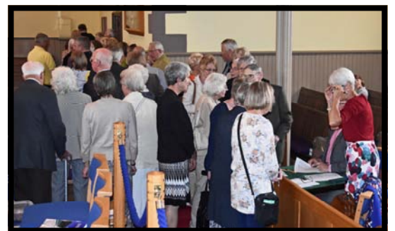
Queues at the voting stations!